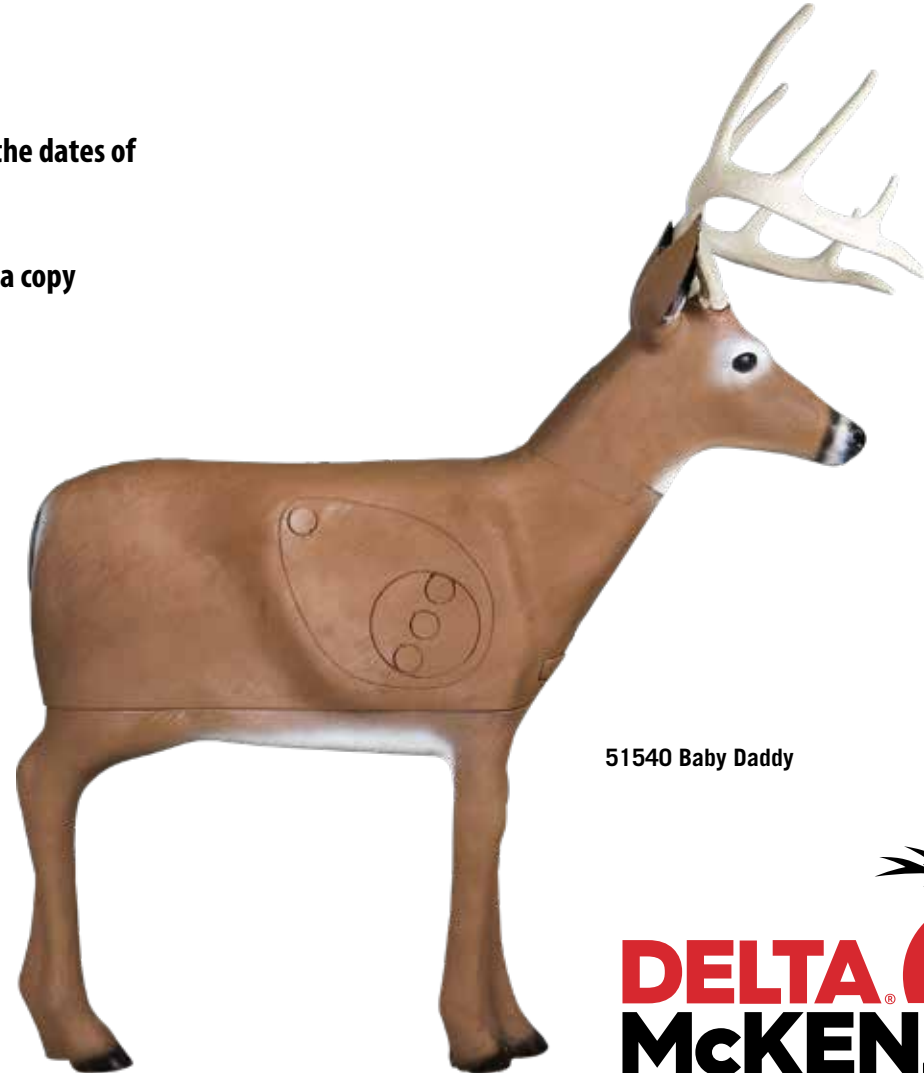
51540 Baby Daddy